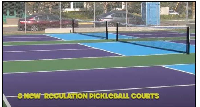
Tennis Court to Pickleball Court conversion – before & after