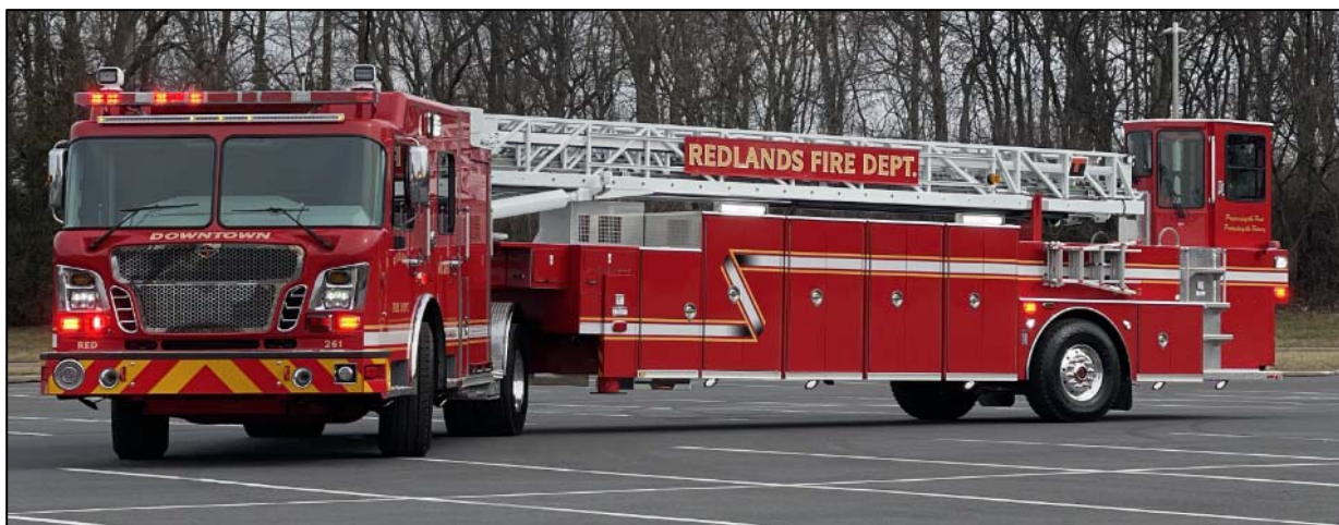
Brand new Redlands Fire Ladder Truck

In terms of public infrastructure, there are several areas in which Measure T has been invested: tree trimming, street & signal light repair, ball field maintenance and construction of new ball fields, general park repairs, restriping of streets and crosswalks, and ADA ramp and sidewalk replacement.