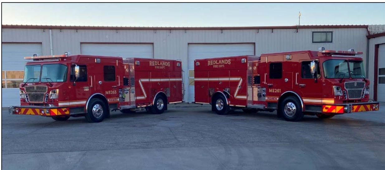
Two brand new Redlands Fire Type 1 Engines

The Fire Department received funding for the purchase of two (2) Type 1 engines and 1 tractor-drawn aerial engine (Ladder Truck). The City received the Type 1 engines in the summer of 2022 and anticipates taking delivery of the tractor-drawn aerial engine by April 30, 2023. In addition to funding to purchase the fire engines, funding to hire a deputy fire marshal and a fire prevention inspector was also authorized.