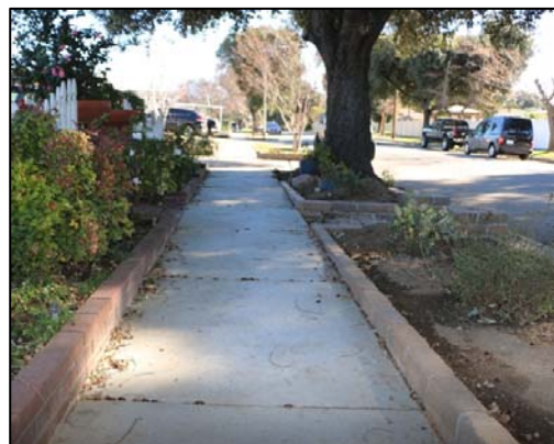
Sidewalk Replacement Project