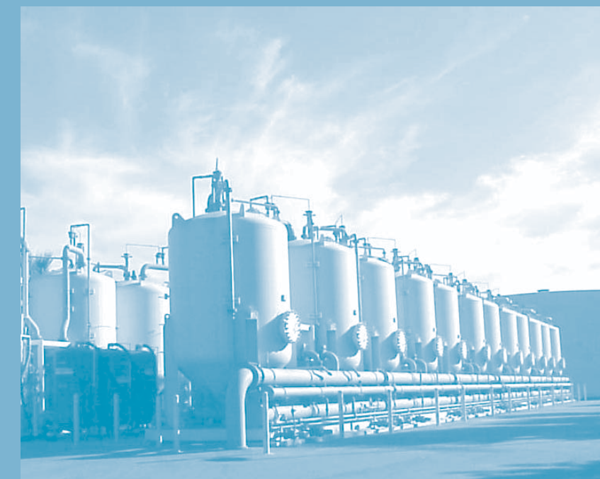
Treatment facilities like this are being used to test perchlorate treatment methods.

In 2004, under a cooperative agreement with Lockheed-Martin Corporation, Lockheed installed a new state-of-the-art ion exchange water purification system to remove perchlorate from Rees Well.