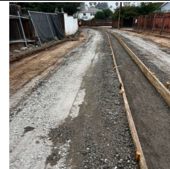
The contractor placed base material on the east alley of Grove Street

Construction notices have been given to affected residents. If restricted parking is necessary, "No Parking" signs will be posted 48 hours in advance of construction activities. Alleys will be closed for 3 weeks.