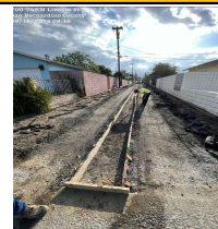
The contractor is excavating and setting forms for the new V-gutter

Construction notices have been given to affected residents. If restricted parking is necessary, "No Parking" signs will be posted 48 hours in advance of construction activities. Alleys will be closed for 3 weeks.