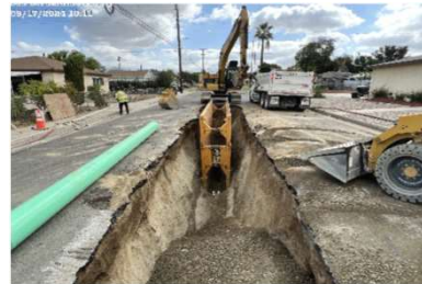
Sewer line installation on Brockton Avenue

Construction notices have been given to affected residents. If restricted parking is necessary, "No Parking" signs will be posted 48 hours in advance of construction activities.