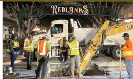
Night work replacing sewer line on Cajon Street and State Street

Construction notices have been given to affected residents. If restricted parking is necessary, "No Parking" signs will be posted 48 hours in advance of construction activities.