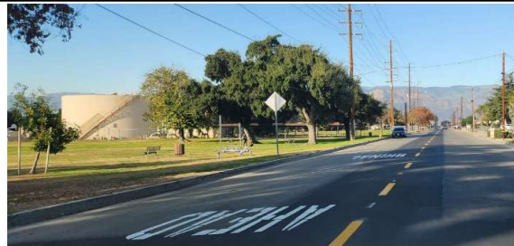
Newly paved and striped road on Texas Street

Construction notices have been given to affected residents. If restricted parking is necessary, "No Parking" signs will be posted 48 hours in advance of construction activities.