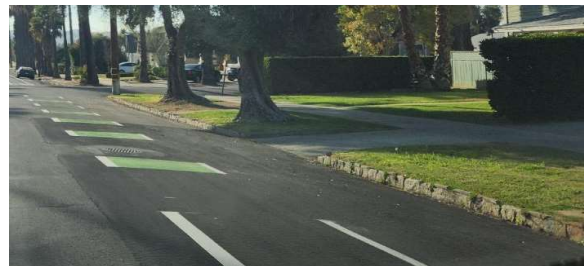
Newly paved and striped bike lane on Olive Street

Construction notices have been given to affected residents. If restricted parking is necessary, "No Parking" signs will be posted 48 hours in advance of construction activities.