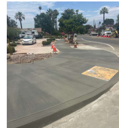
New ADA Ramp at Lakeside Avenue

Construction notices have been given to affected residents. If restricted parking is necessary, "No Parking" signs will be posted 48 hours in advance of construction activities.