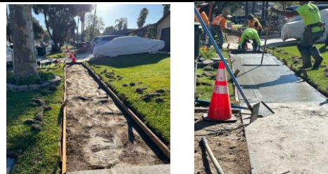
Grading, setting forms, and placing concrete on Raemee Avenue

Construction notices have been given to affected residents. If restricted parking is necessary, "No Parking" signs will be posted 48 hours in advance of construction activities.