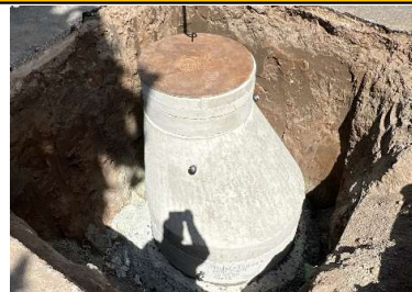
Manhole installation on Bond Street

Construction notices have been given to affected residents. If restricted parking is necessary, "No Parking" signs will be posted 48 hours in advance of construction activities.