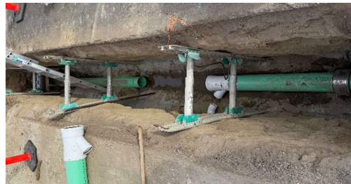
Spot repair on Clay Street

Construction notices have been given to affected residents. If restricted parking is necessary, "No Parking" signs will be posted 48 hours in advance of construction activities.