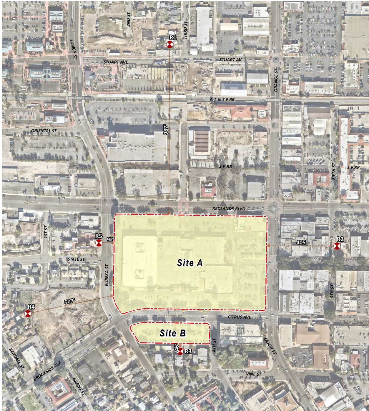
EXHIBIT 3-A: SENSITIVE RECEPTOR LOCATIONS