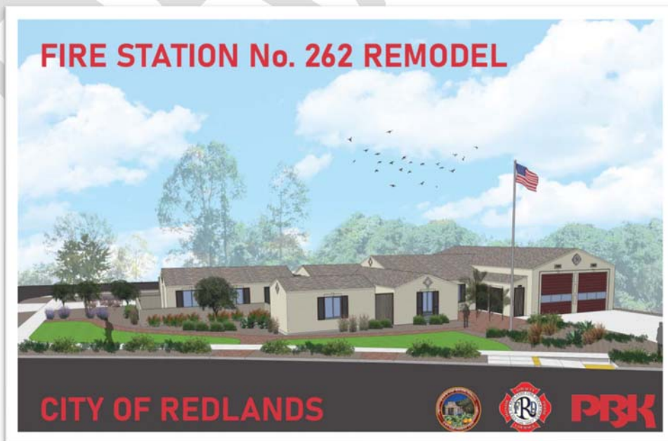
Rendering of Final Design for Station 262