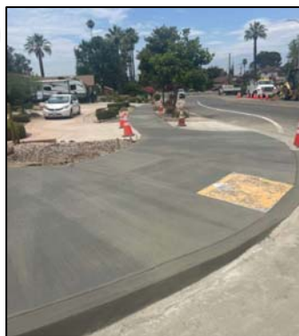
New ADA Ramp at Lakeside Avenue

Lastly, Measure T enabled investment into enhancing and restoring certain ‘quality of life’ amenities and services for the community. Some examples of this include: