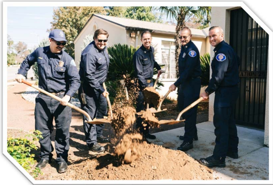
Fire Station 262 Groundbreaking

For the Fire Department, the largest upcoming project for which Measure T have been dedicated is the remodel of Fire Station 262 to address updates needed to maintain compliance with building standards for fire station facilities. The groundbreaking ceremony took place in Spring of 2024 and substantial work has been completed as of the close of FY 2024. In addition to this project, there are other efforts underway to upgrade and replace the Fire Department's light duty fleet with new vehicle leases. There have also been several projects involving fire station facility upkeep. Replacement of the heating, ventilation and air conditioning system (HVAC) was completed for Station 264.