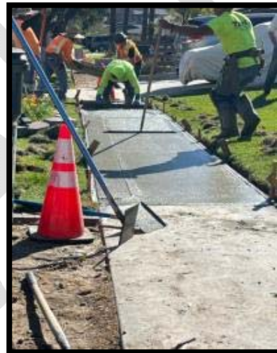
Grading, setting forms, and placing concrete on Raemee Avenue