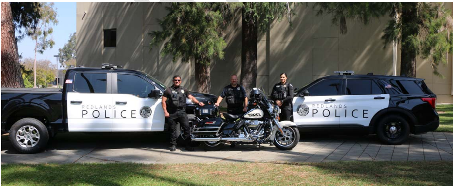
Officers with new vehicles

Looking over Figure 2 provided on the preceding page (page 5), public safety needs received a total of approximately $10.3 million in Measure T funds, up from $8.8 million in the prior year (2023). The Police Department received funding for roughly 30 positions within the department, including 9 sworn positions (officers or higher). In addition to this, 30 new vehicles were received and outfitting, with 16 of these dedicated to replacing aging patrol vehicles. Also, the outfitting and gear needed to commission these new vehicles was also funded through Measure T. The Police Department also received funding for investment in technology to enhance crime prevention and investigations. They include surveillance cameras to improve citywide security, digital forensics tools for extracting and analyzing evidence from mobile devices, software to assist with financial investigations and asset tracking, and updated legal resources to streamline warrant processing. These tools ensure officers have the necessary resources to investigate crimes effectively and protect the community.