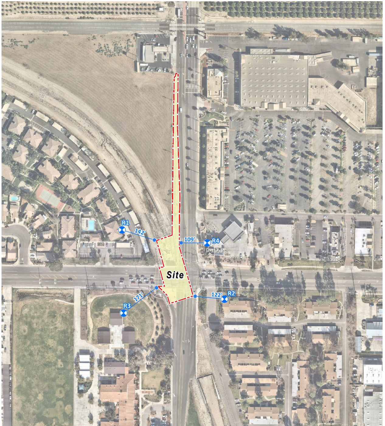
EXHIBIT 2: SENSITIVE RECEPTOR LOCATIONS