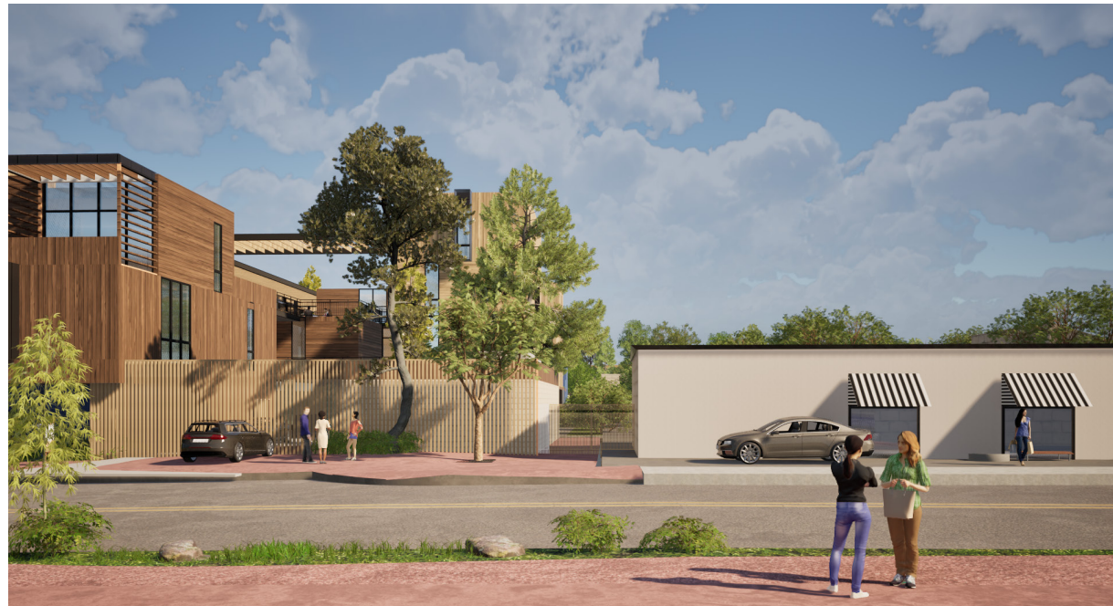
VIEW @ STUART AVE. ENTRANCE | DRIVEWAY & ADJACENT COMMERCIAL 07