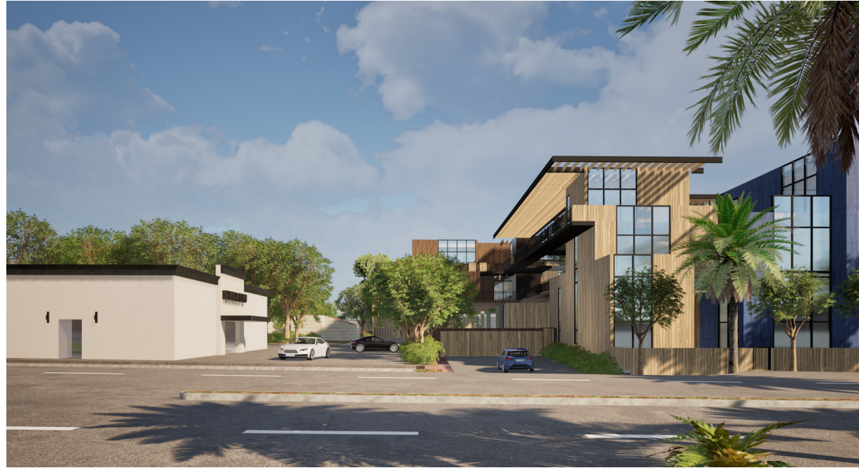
VIEW @ EUREKA ST. ENTRANCE | DRIVEWAY & ADJACENT COMMERCIAL 08