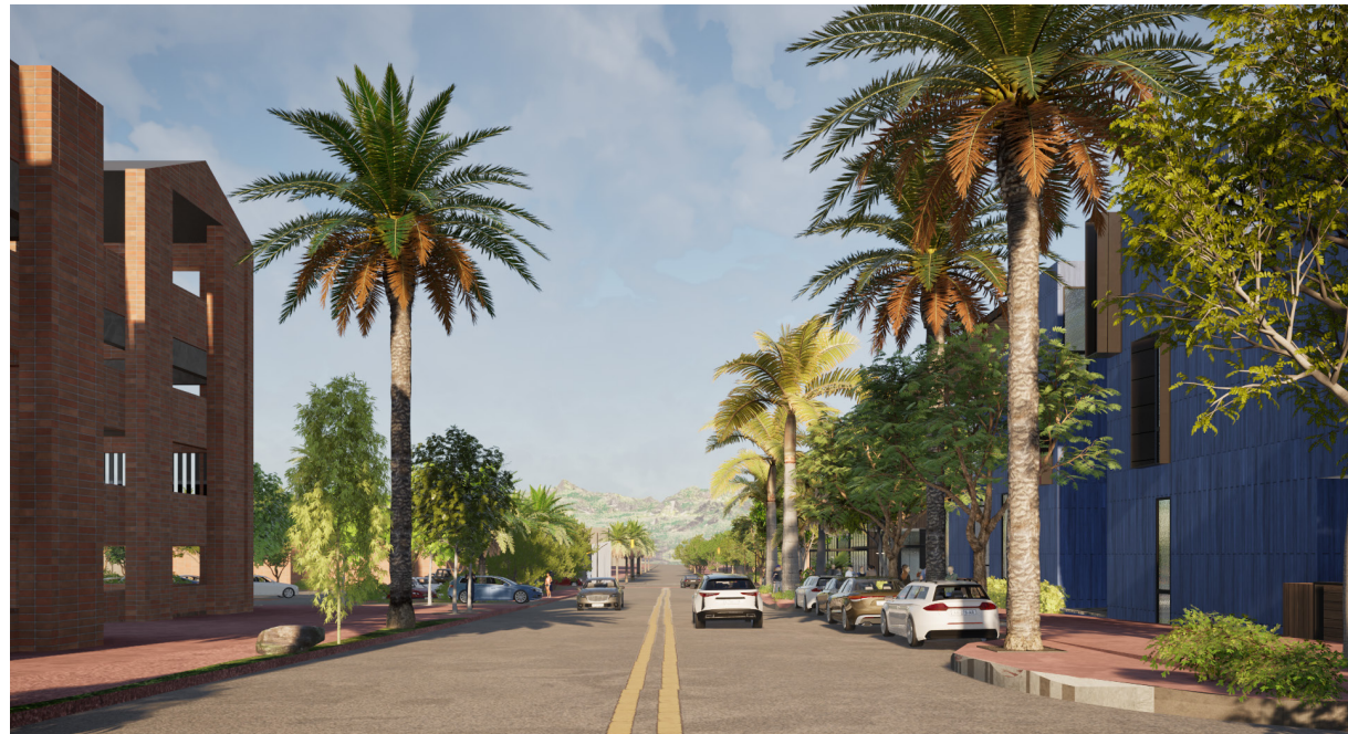
VIEW @ STUART AVE. FACING WEST OPPOSITE PARKING STRUCTURE 14