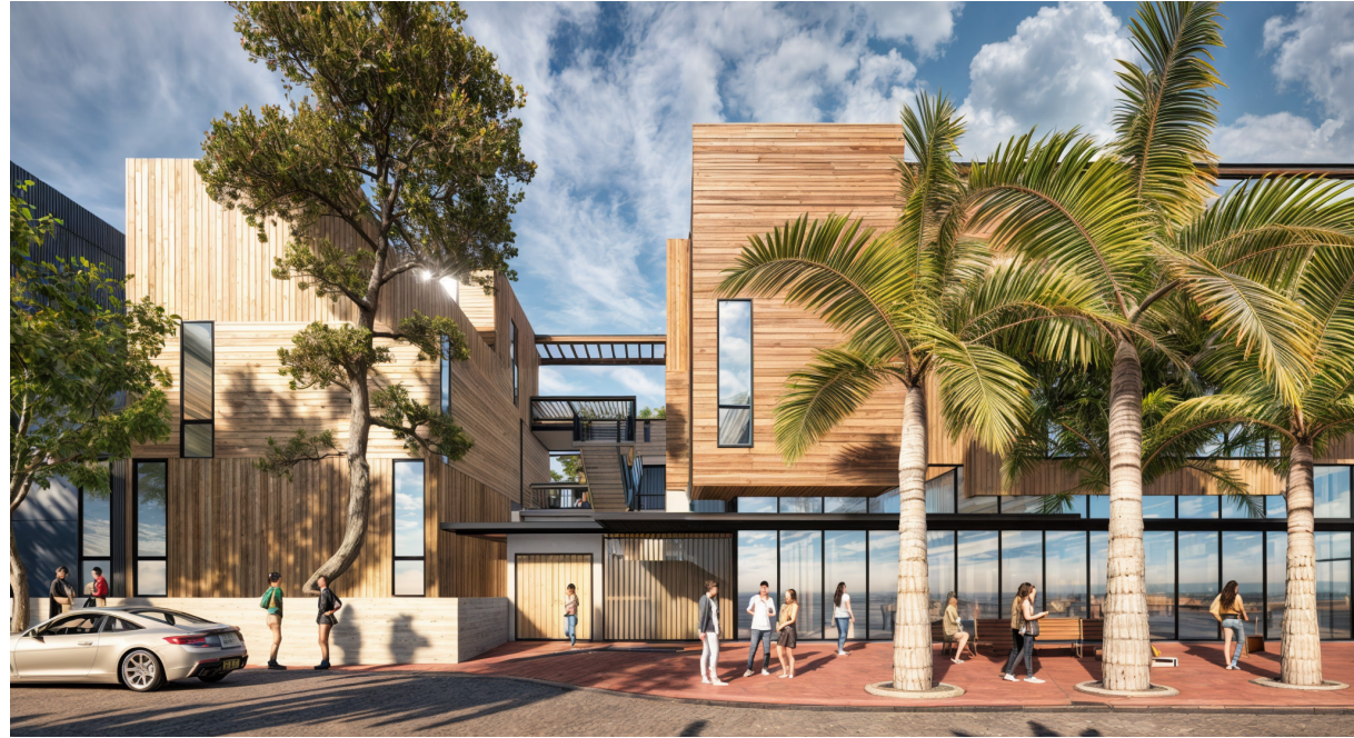
VIEW @ EUREKA ST. | PEDESTRIAN ENTRANCE & RETAIL 08