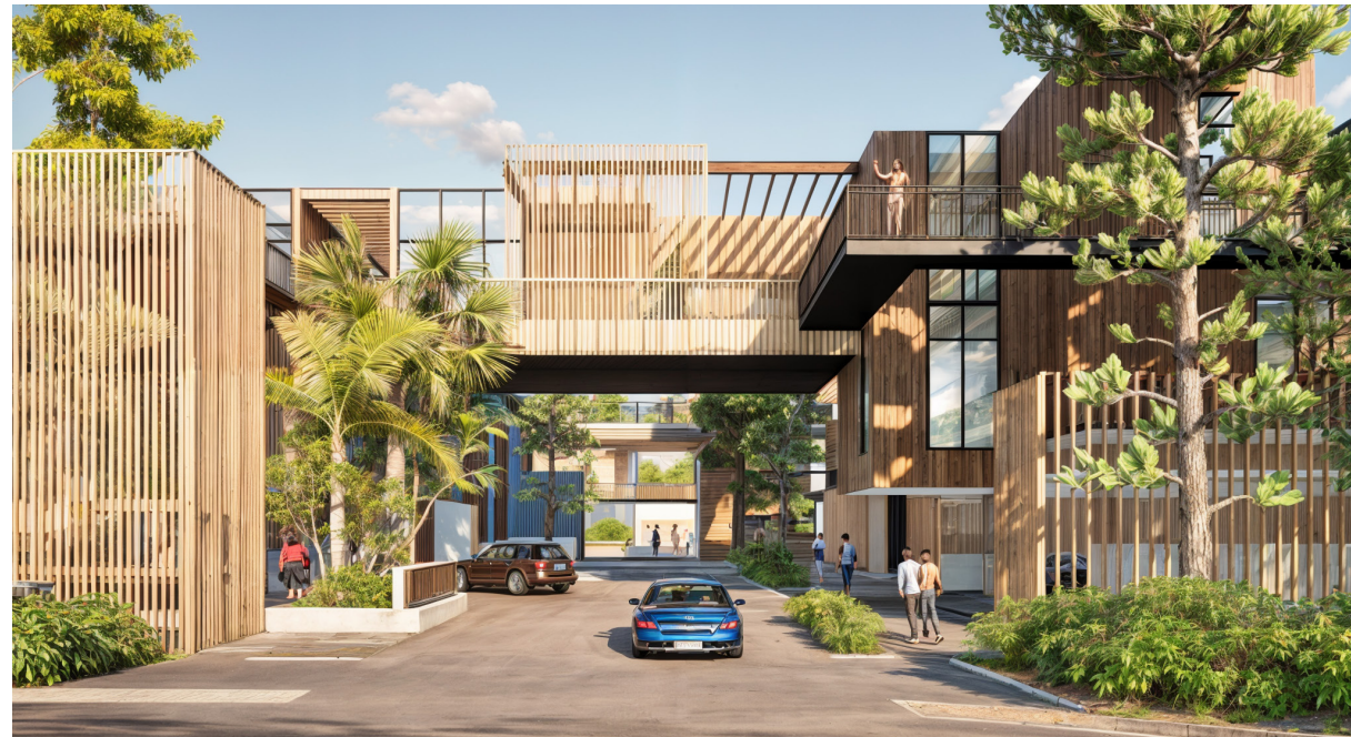
VIEW @ RUIZ / HIGH ENTRANCE | DRIVEWAY & PASEO 03

SEE SHEET A0.04 & A0.05 FOR ALL 3D VIEWS