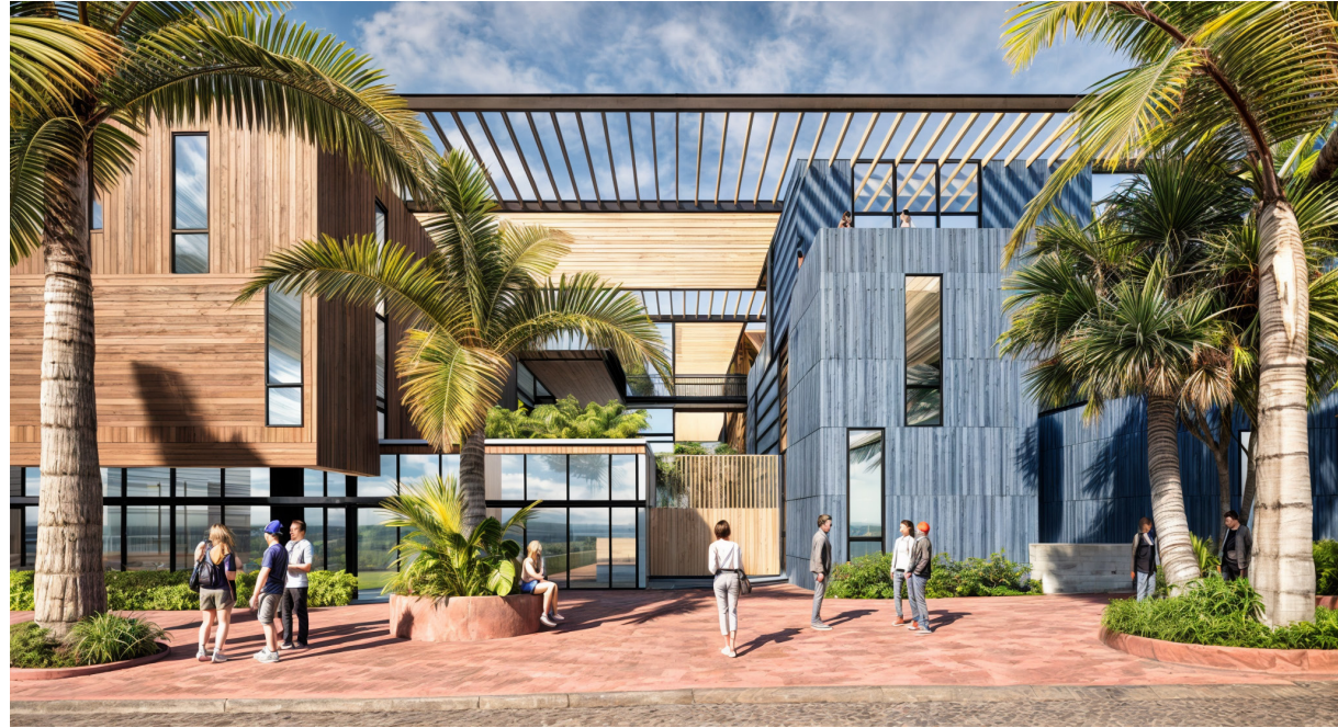
VIEW @ STUART AVE. | LOBBY ENTRANCE 06