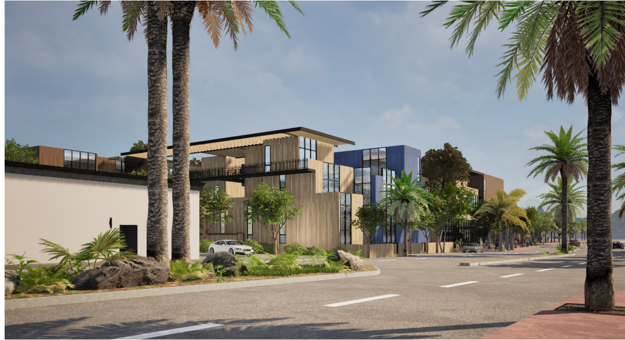
VIEW @ EUREKA ST. FACING SOUTHEAST AT ADJACENT COMMERCIAL 16