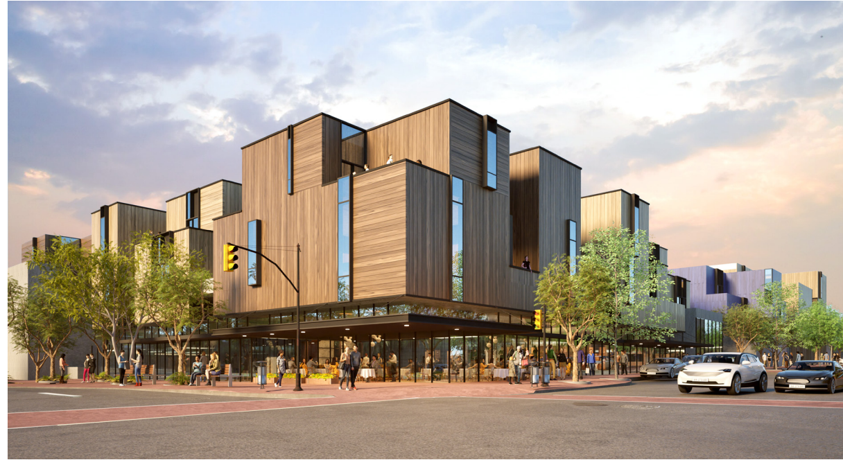
VIEW @ STUART AVE. & EUREKA ST. | RETAIL CORNER 04