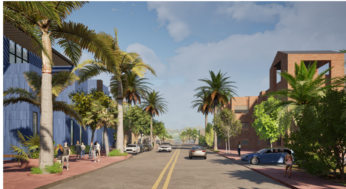
VIEW @ STUART AVE. FACING EAST OPPOSITE PARKING STRUCTURE 06

SEE SHEET A0.04 & A0.05 FOR ALL 3D VIEWS