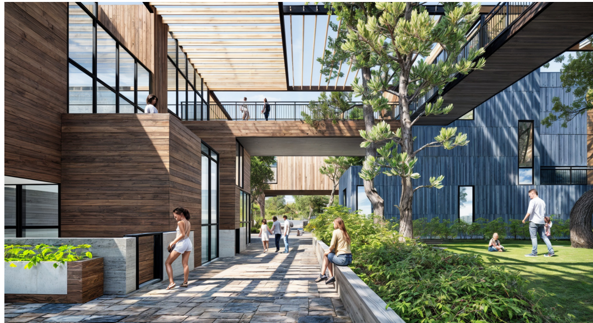
VIEW @ PUBLIC PASEO 05

SEE SHEET A0.04 & A0.05 FOR ALL 3D VIEWS