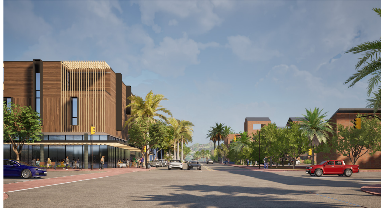
VIEW @ STUART AVE. FACING EAST AT EUREKA 05