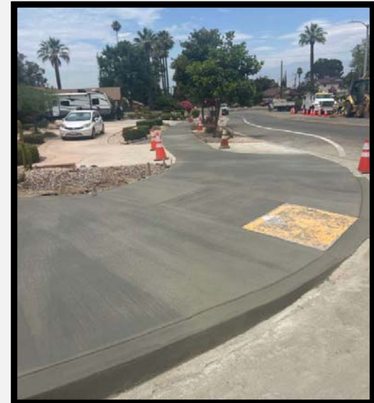
Sidewalk and ADA Ramp Improvements