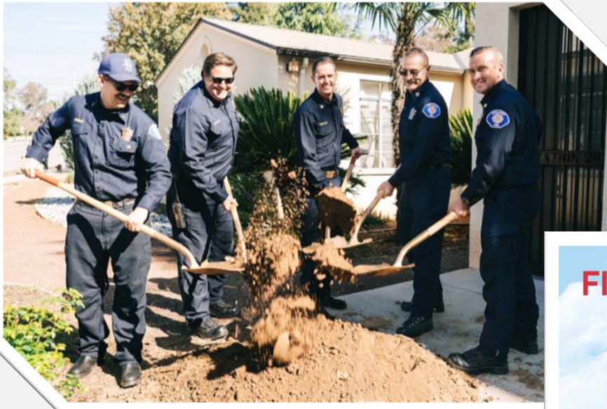
Fire Station 262 Renovations