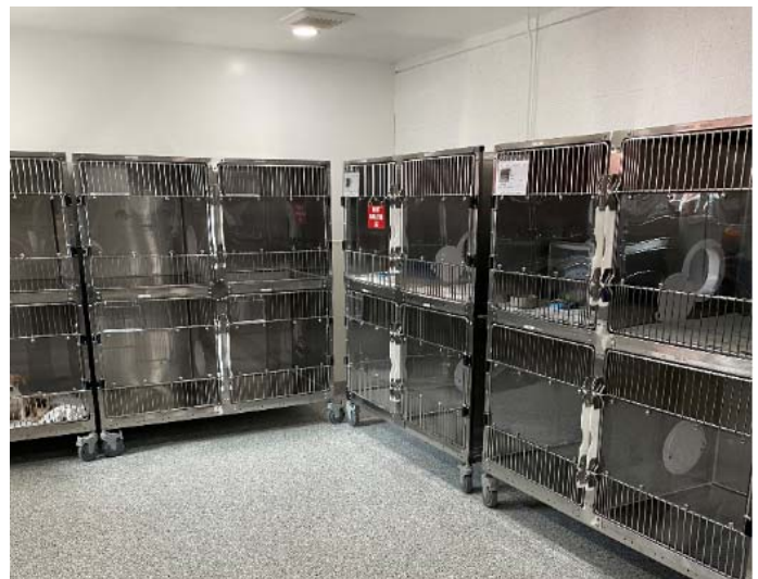
Cattery Facility at the Redlands Animal Shelter – before & after