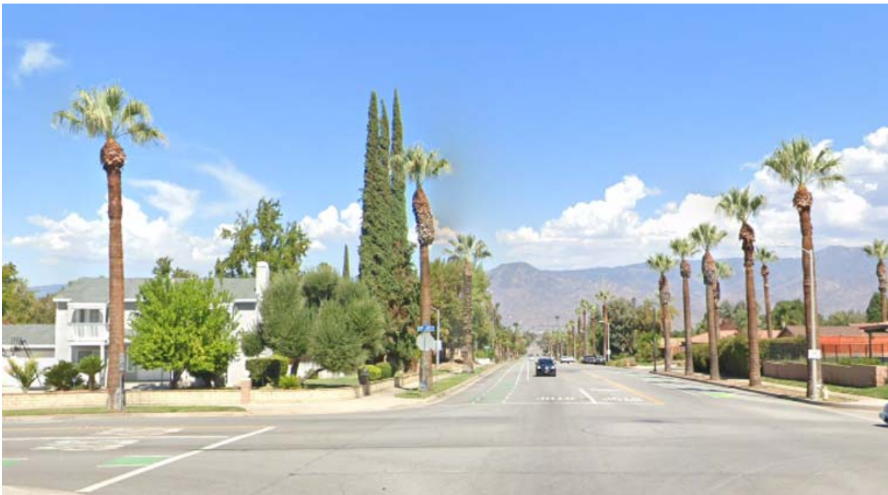
Tree Trimming Efforts – before & after (Ford Street at E. Highland Avenue)