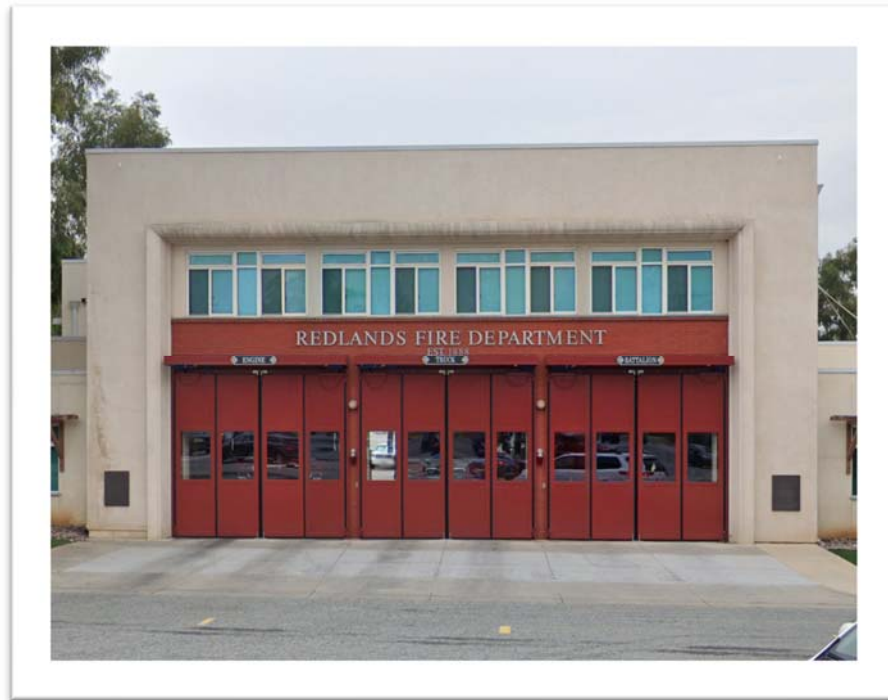
Station 261 Brand New Bay Doors

In terms of public infrastructure, there are several areas in which Measure T has been invested: tree trimming, ADA ramp and sidewalk replacement, park playground improvements, increased replacement of traffic signals and cabinets, proactive servicing of streetlights, replacement of aged and outdated equipment, and public alley repaving.