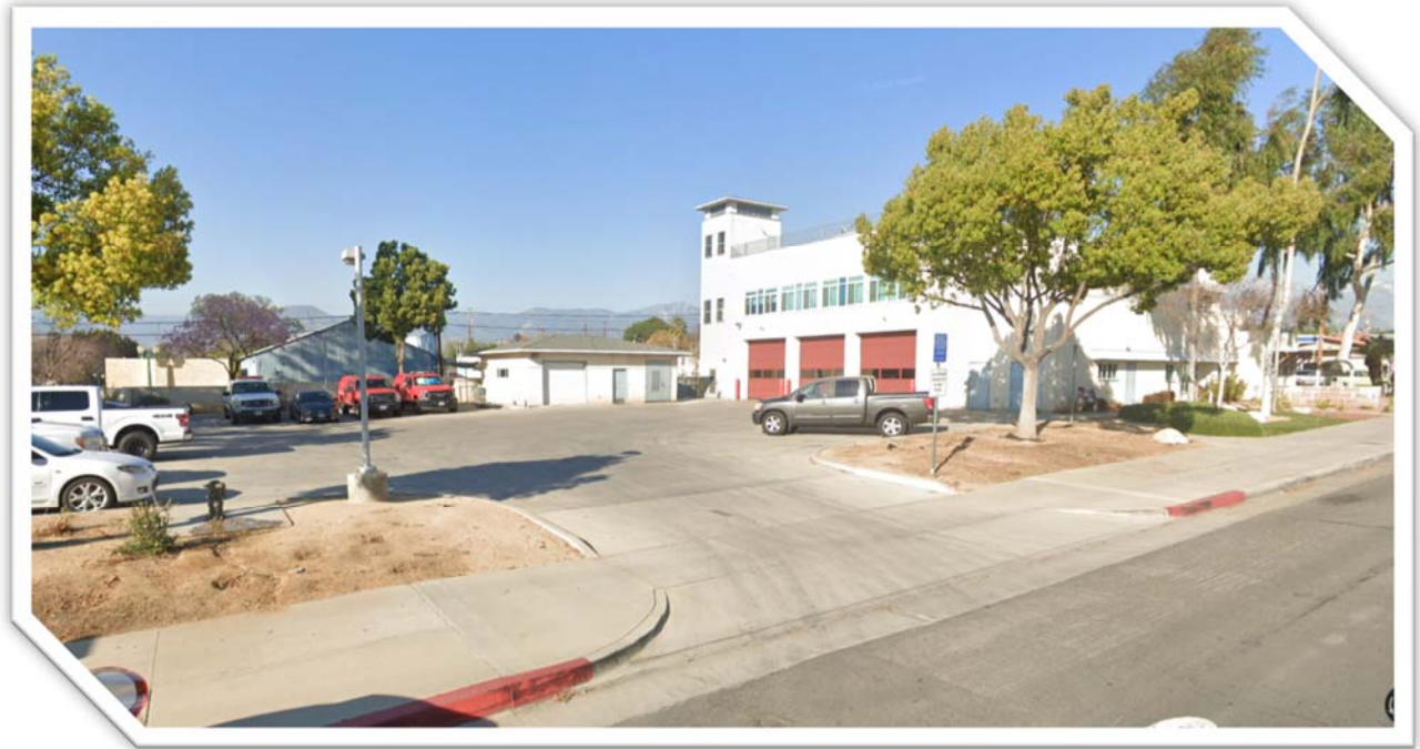
Fire Station 261 Before Security Fence & Gate