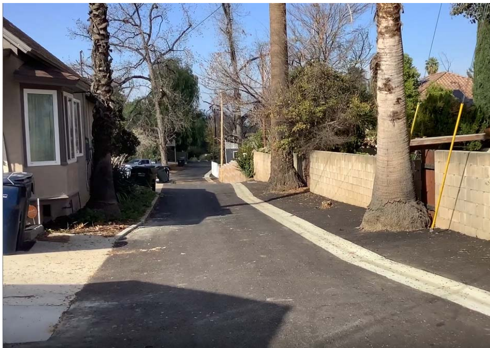
Alley Repaving Project – before and after on Steele Street

Lastly, Measure T enabled investment into enhancing and restoring certain ‘quality of life’ amenities and services for the community. Some examples of this include: