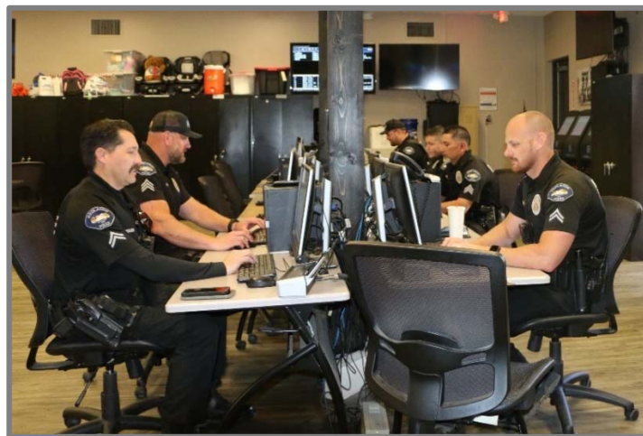
Officers at report writing desks

Looking over Figure 2 provided on the preceding page (page 5), public safety needs received a total of approximately $8.8 million in Measure T funds. The Police Department received funding for restoring and enhancing roughly 28 positions within the department. This included 5 police officer positions that were restored after budgets were cut in the midst of the COVID-19 pandemic and an additional 2 officer positions that were added to enhance staffing levels. In addition to this, 14 new vehicles were received and 11 of these replacements are for existing patrol vehicles. Also, the outfitting and gear needed to commission these new vehicles was also funded through Measure T. The Police Department also received funding for several software integrations between their existing computer-aided dispatch system and citation and GIS software products. Other specialized equipment included the purchase of updated SWAT response equipment, GPS trackers to combat organized retail crime and special forensic processing technology tools.