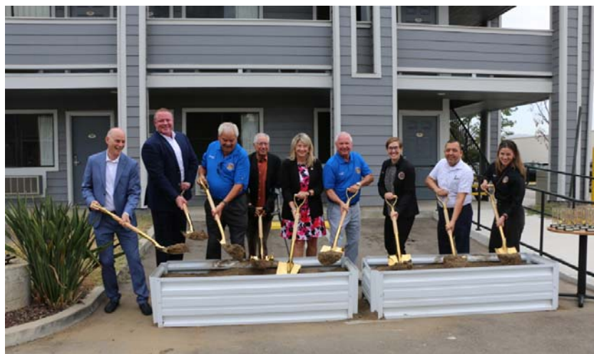
Groundbreaking at the Good Nite Inn – site of the City’s Project Homekey