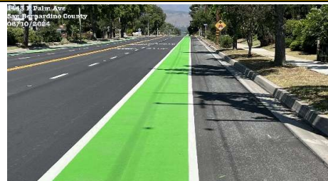
Newly painted bike lane on Palm Ave.

The City of Redlands Municipal Utilities and Engineering Department would like to thank all of our residents for their cooperation and patience throughout this project.