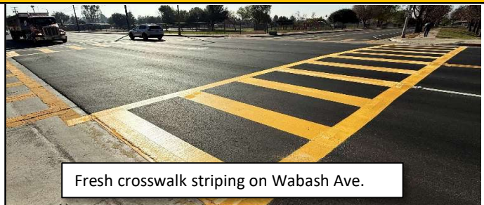
Fresh crosswalk striping on Wabash Ave.

Construction notices have been given to affected residents. If restricted parking is necessary, "No Parking" signs will be posted 48 hours in advance of construction activities. Please take the proper precautions, and follow posted construction signs and installed traffic control.